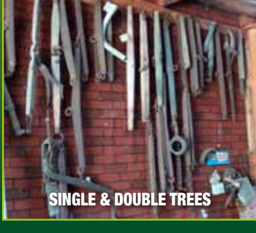
SINGLE & DOUBLE TREES