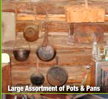
Large Assortment of Pots & Pans