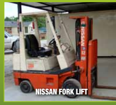
NISSAN FORK LIFT