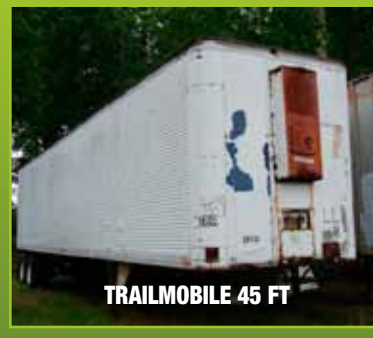
TRAILMOBILE 45 FT