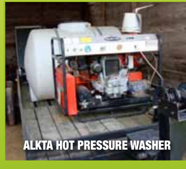
ALKTA HOT PRESSURE WASHER