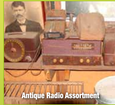
Antique Radio Assortment