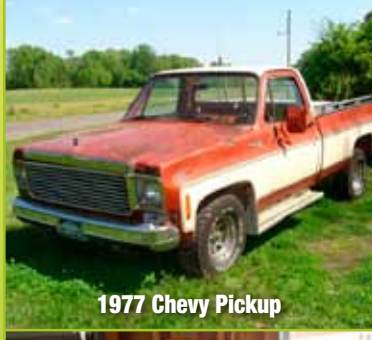
1977 Chevy Pickup