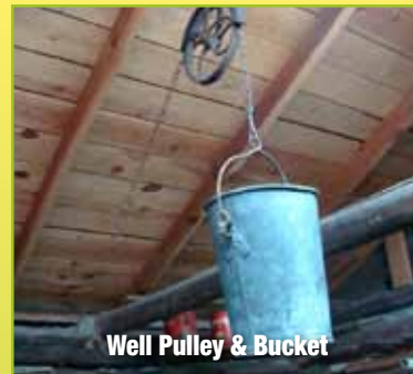
Well Pulley & Bucket