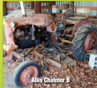
Allis Chalmers B