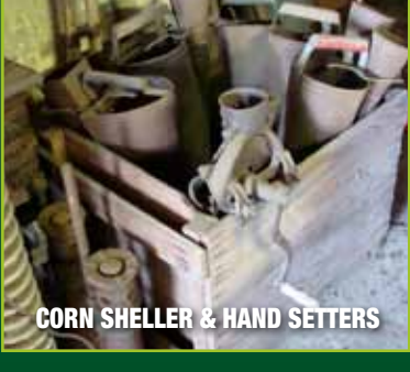
CORN SHELLER & HAND SETTERS