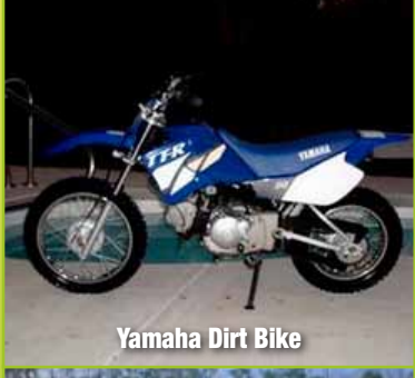
Yamaha Dirt Bike