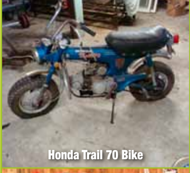
Honda Trail 70 Bike