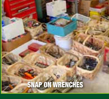
SNAP ON WRENCHES