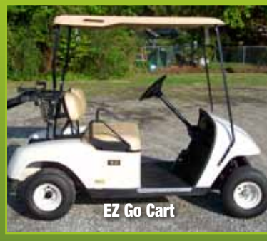
EZ Go Cart