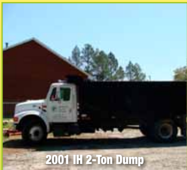
2001 IH 2-Ton Dump