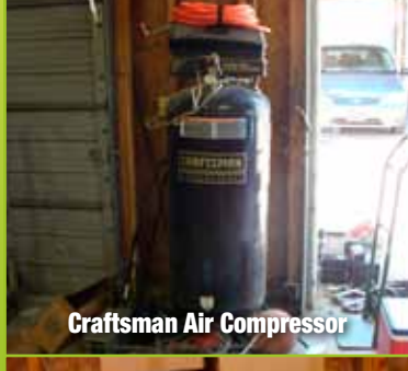
Craftsman Air Compressor