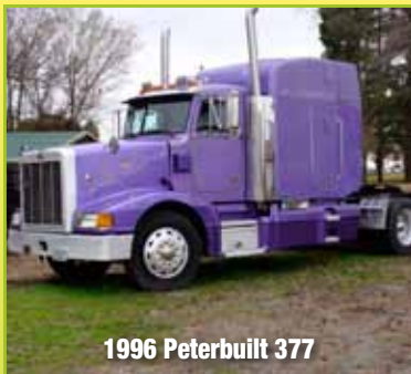
1996 Peterbilt 377