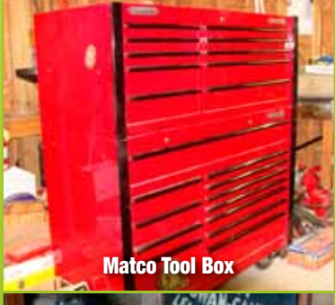
Matco Tool Box